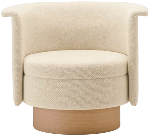
N-SW01 Lounge Chair

DESIGN: Norm Architects CASE : BELLUSTAR TOKYO