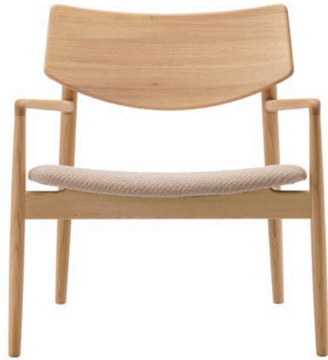
A-LC01 Lounge Chair